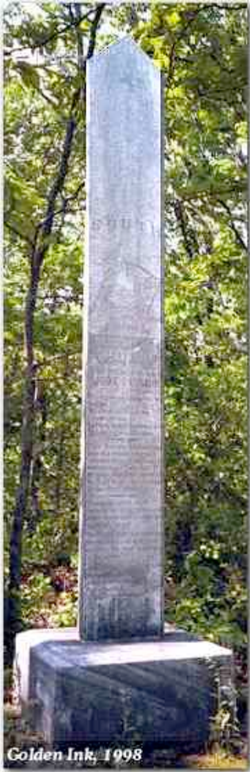
Monument on the spot where General Leonidas Polk died

remained faithful to the Union. This caused a family rift that was not reconciled until well after the WBTS. During the war John Rogers Cooke was wounded seven times. After the war he returned to Richmond as a merchant. He was one of the organizers of Richmond's Confederate Soldier's Home. John Rogers Cooke died on April 10 th , 1891 and is buried in Richmond's Hollywood Cemetery.